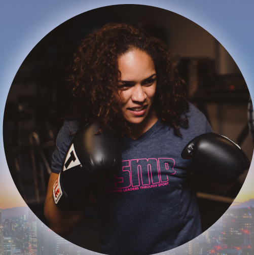
ALINE SILVA BRAZIL